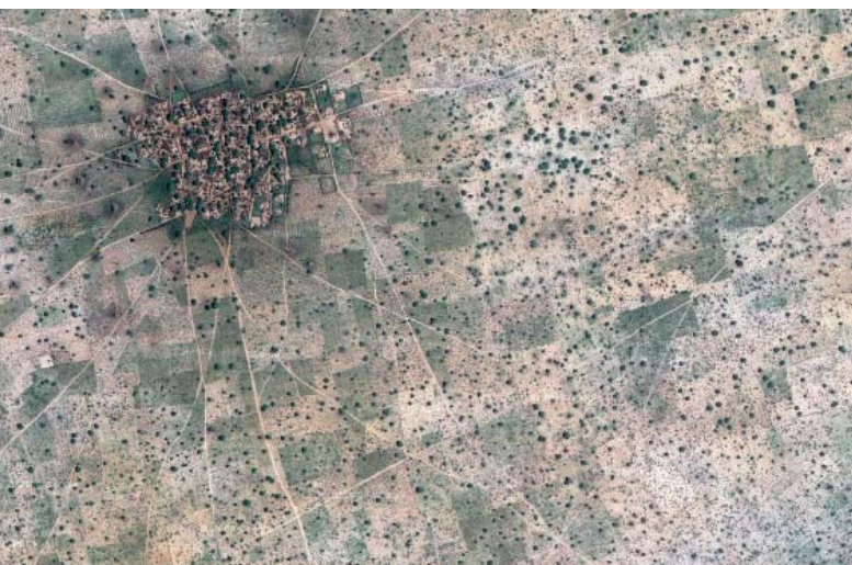
Satellite view of a village in Maradi region (Google Maps)