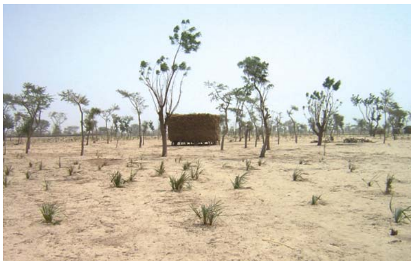
Assisted natural regeneration. Maradi region, Niger (S. Jauffret)

projects include the Algerian Green Dam project which, as indicated in published reports and findings, met with some success but also quite a few failures, resulting in major project changes. The Great Green Wall of China has not been designed as a dam but instead it is a gigantic integrated management project to combat desertification in an area of over 4000 km long and 1000 km wide. This involves a combination of forest and shrub plantations, grassy vegetation cover in farming systems.