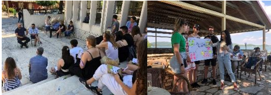
Figure 4: Summer school in Greece

Lastly, we have developed Digital Badges to recognise student's learning, knowledge and skills gains. Digital Open Badges provide unlimited ways of communicating knowledge, skills, and competencies. In the course of RUR'UP project, they were used to validate key milestones reached within the online course and skills the student has acquired in each stage of the course. The Digital Badge is in the form of an online certificate that contains the metadata which describes: the name of the badge, its description and criteria page. We have developed in total three digital badges, two for the e-course and one for the completion of the summer school these were: