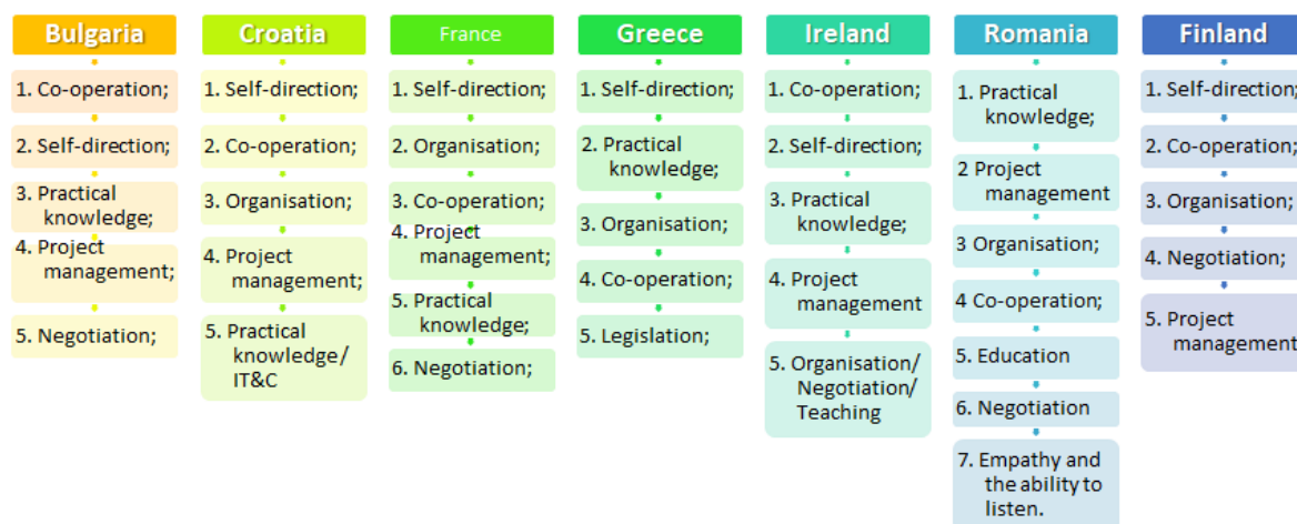
Figure 3: Identified skills needed by future graduates to improve the sustainability of the peripheral rural area (source: RUR'UP project, from own data)

Firstly, we have produced a report that delineates the identified gaps in the HE relating to peripheral rural areas and the needs of the local actors (working on those areas). Figure 3 identified the gap between the knowledge and the skills that graduates acquired and the knowledge and skills required by local actors to work in such areas.