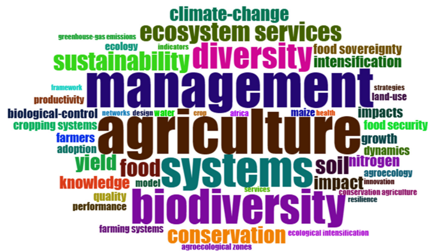
Figure 2. Representation of the most frequent terms.